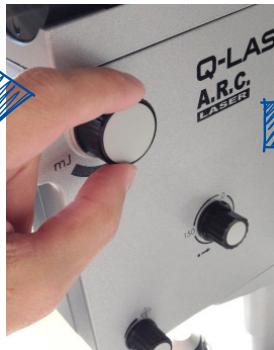
Set the power to 05.0 mJ